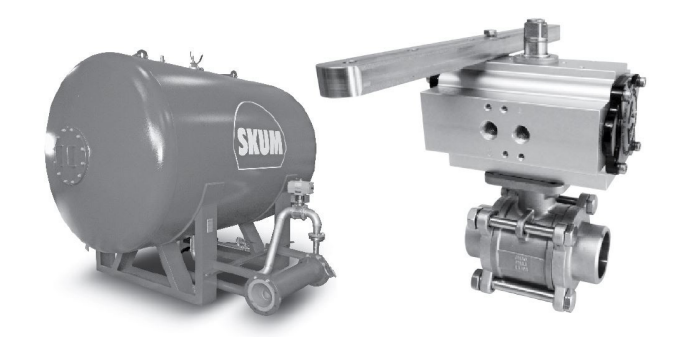
WAFV-MK2 40 WE PRE-PIPED BLADDER TANK FOAM SYSTEM INCLUDING WAFV