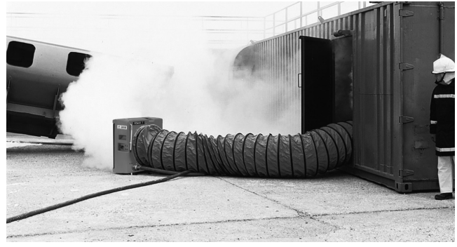
FOMAX 7 smoke extractor model