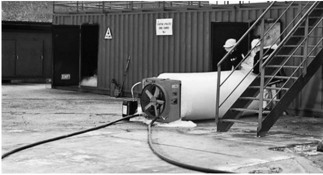
FOMAX 7 foam generator